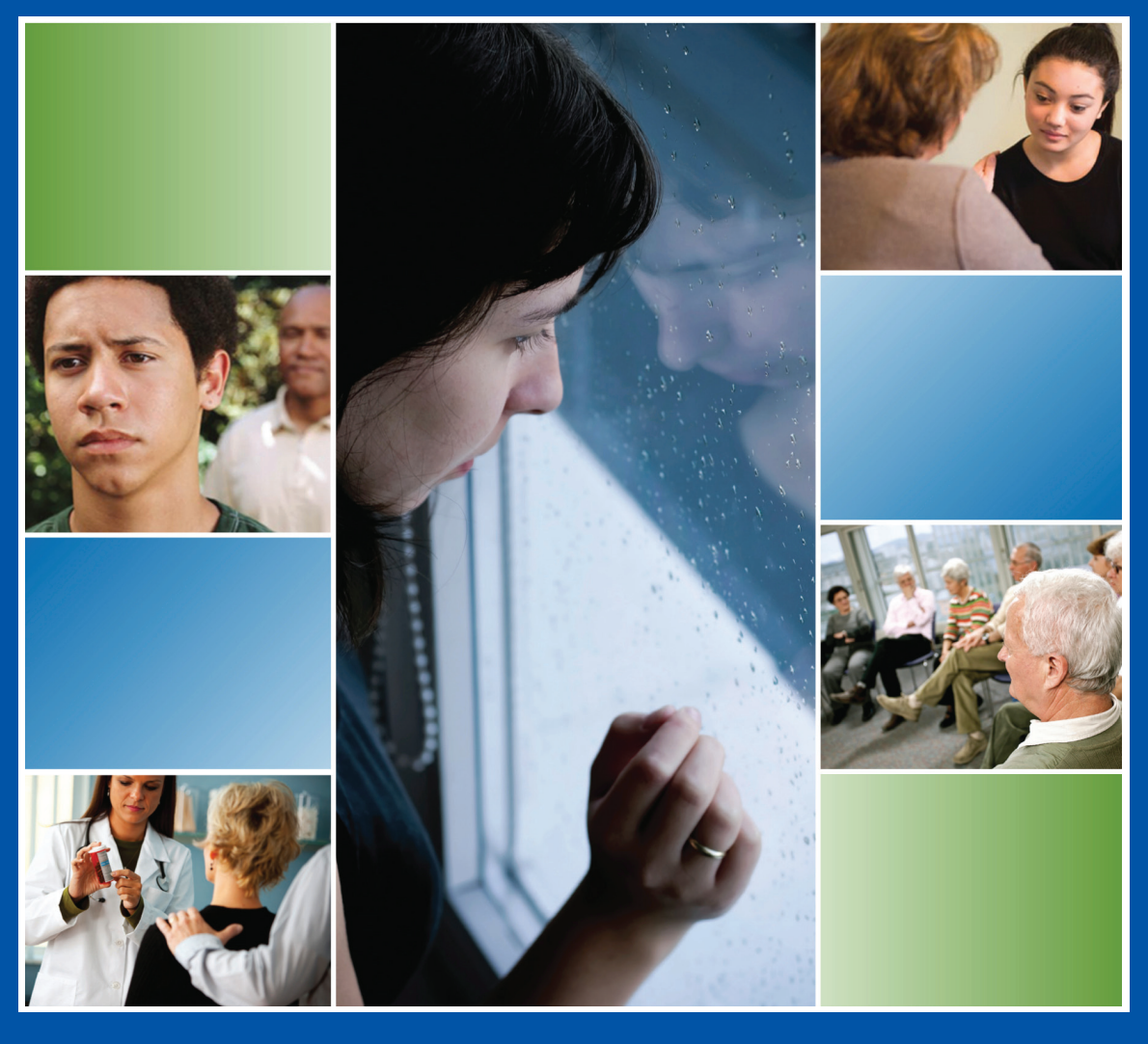
U.S. Department Of Health & Human Services National Institutes Of Health